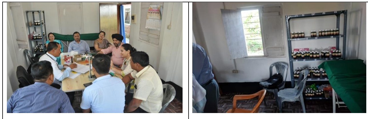
Fig 15: PHC, Kumbhi at Bishnupur District