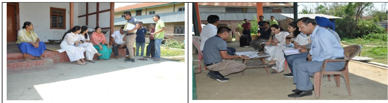
Fig 11: Public Health Outreach Activity at Thoubal Bazar

The team interacted with the villagers residing nearby the locality. On interaction, villagers seems satisfied with the 2 days health check up camp in their area and many villagers were benefitted by AYUSH medicines mostly for water borne diseases.