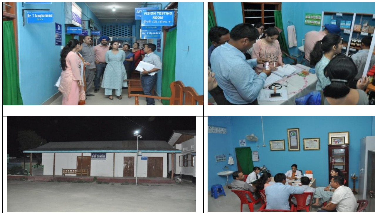
Fig. 5 CHC Wangoi, Imphal West District

repair, renovation, alteration etc, @ Rs. 3.00 Lakhs for equipment, furniture etc, @ Rs. Rs. 03.00 Lakhs for medicines and @ Rs. 1.00 lakhs for contingency )in the year 2007-08 for upgradation of CHC. The State has constructed 2 rooms from the amount however, both the rooms were handed over to the Allopathy for National Health Programme i.e. OST Centre in Nov, 2015. In this regard, State was suggested to take up the matter so that needful action may be done.