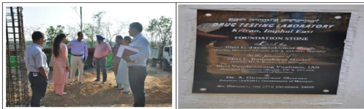
Fig:21 Construction Site of Drug Testing Laboratory, Keiro, Imphal East

Rs. 50.00 Lakhs approved during supplementary grant of 2018-19 was not earmarked for DTL. Further, it was informed that the proposal of appointment of Manpower has been moved to the Government of Manipur.