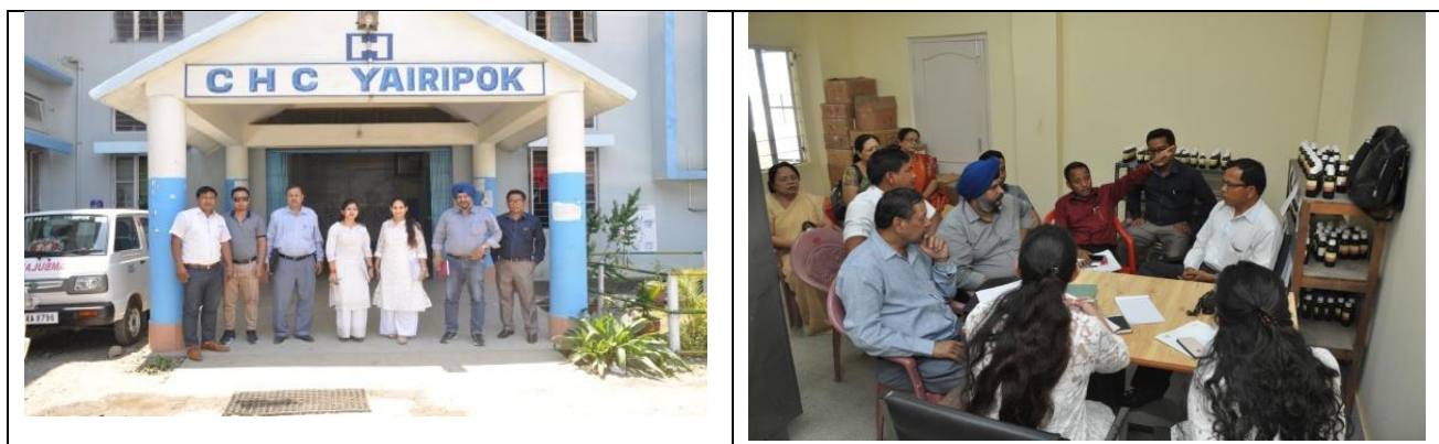
Fig:9 CHC, Yairipok, Thoubal District