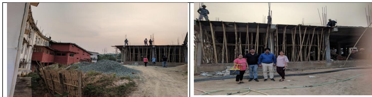
Fig:20 50 bedded integrated AYUSH Hospital at Moreh

At the time of visit, 40% construction work of the building was completed. However, no board was available stating all the details of the construction work at the location.