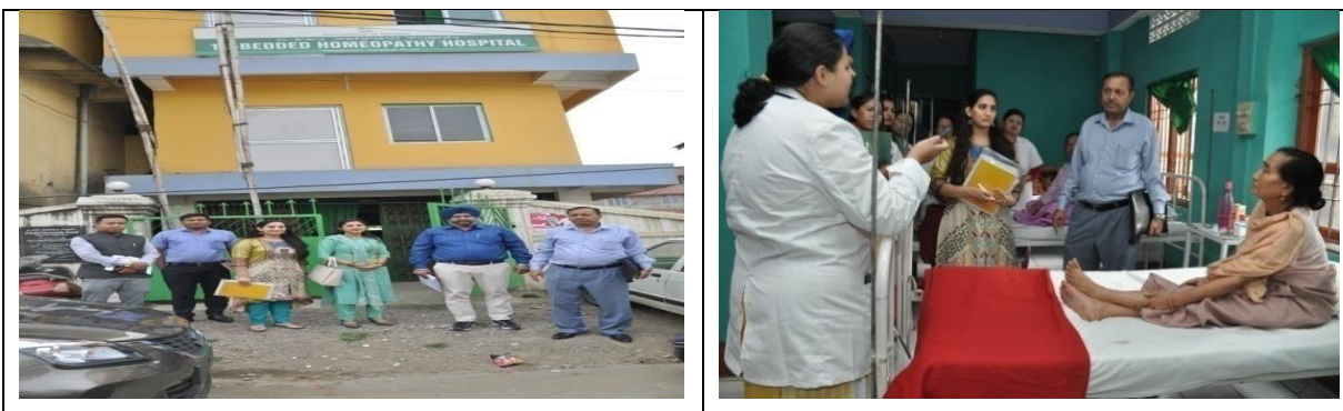
Fig:1 10 bedded Standalone Homeopathy Hospital, Singjamei, Imphal West

The condition of the standalone hospital was found to be average. It has been informed by State that Construction of two floors is under process from State Fund and under NAM funds, which they have got this year only; will make one more floor. Therefore, no amount has been released to work Agency i.e. TP Cell and DPR of the facility is under process. There was one single small room for Panchkarma therapy for both male & female and services of Ayurvedic doctor is being utilised in a homeopathy hospital and only one OPD room was available. The doctors available in the facility demanded separate duty rooms for doctors as at present they were sharing the space with Male Nurse room. Further, it has been informed that medicines which are being procured from IMPCL, HOMCO & Oushidhi in the facility frequently goes out of stock and takes the time of around 3 months for re-stock. The team had collected few samples of medicines and found that 1-2 expired medicines were also stored in the medicine storage room. No doctor has undergone any training programme in the hospital. Interactions with the local representatives and patients brought positive feedback about the above said facility and the doctor.