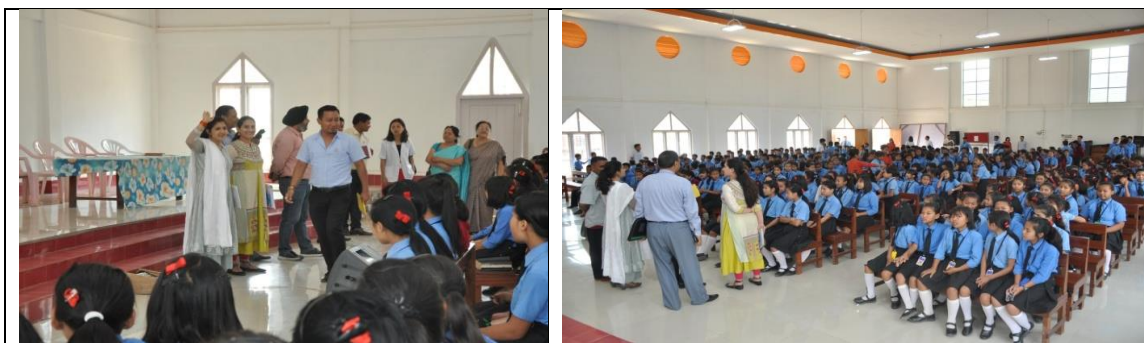
Fig:17 School Health Programme at Mount Carmel School at Churachandpur

Under National AYUSH Mission, an amount of Rs. 1 Lakh has been approved for School Health Programme at Mount Carmel School and Muolvaphei & Greenwood School, Lamka at Churachandpur district in the year 2014-15. State has utilised the whole amount and conducted School Health Programme on 17 th – 18 th May, 2016. Under the programme, State has conducted Health Screening of School children/ Teachers, distributed medicines, Printed School health cards, distributed pamphlets on communicable diseases and other female related diseases.