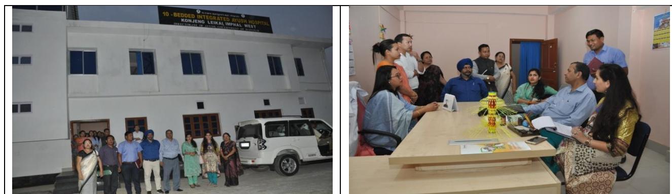
Fig:210 bedded integrated AYUSH Hospital, Konjeng leikai, Imphal West constructed under National AYUSH Mission

started yet. Staffs of 3 Nurse, 1 pharmacist, 3 doctors, 1 Peon, 1 Attendant were available and all were regular.