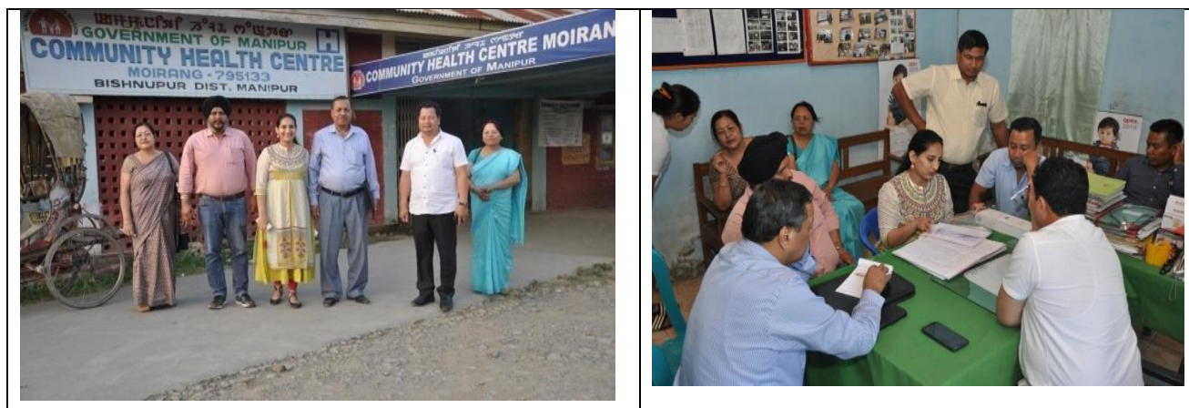
Fig : 16 CHC, Moirang, Bishnupur District