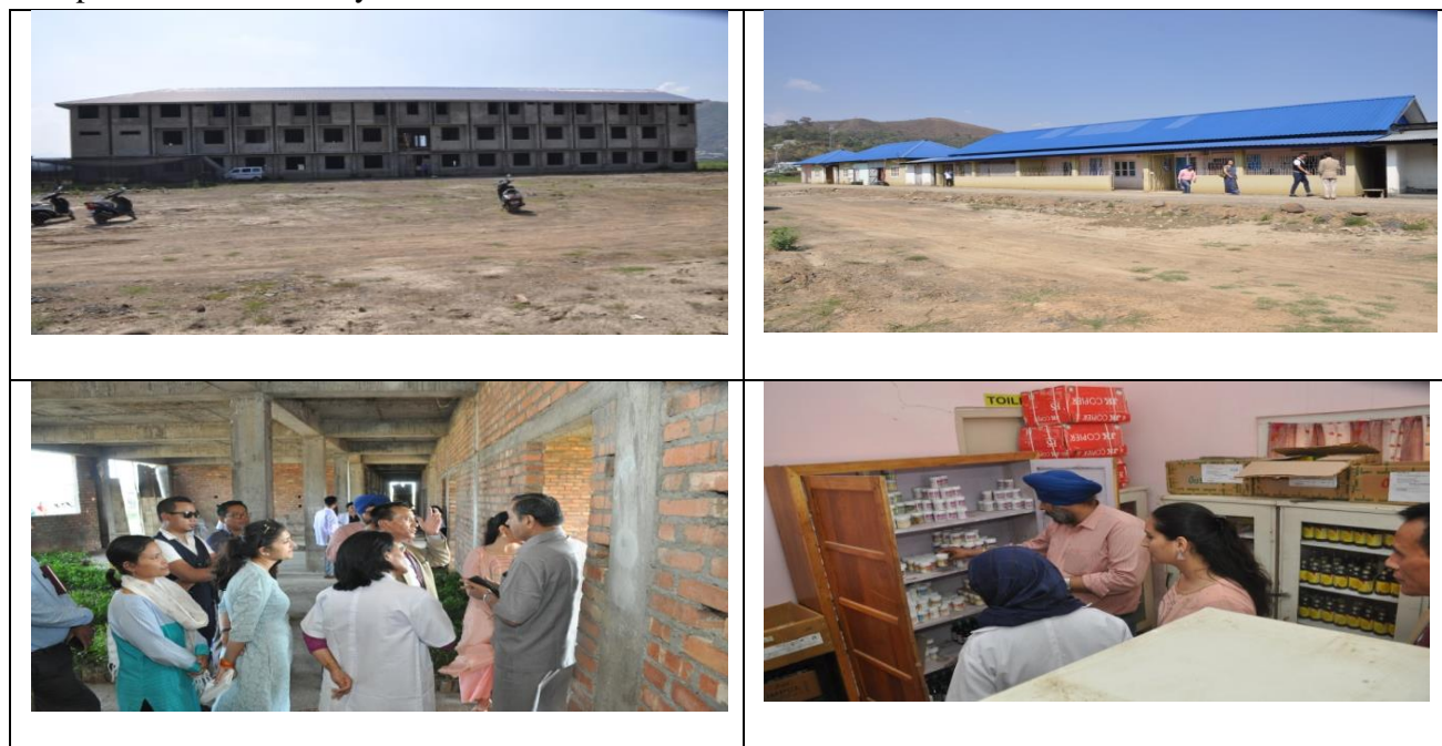
Fig:450 bedded integrated AYUSH Hospital at Lamphelpat

No AYUSH doctor has undergone any training programme. The patients gave positive feedback about the said facility as well as doctor. With respect to medicines, patients stated that most of the medicines found in house however they were distressed at the fact that food has not been provided to the patients in the facility itself.