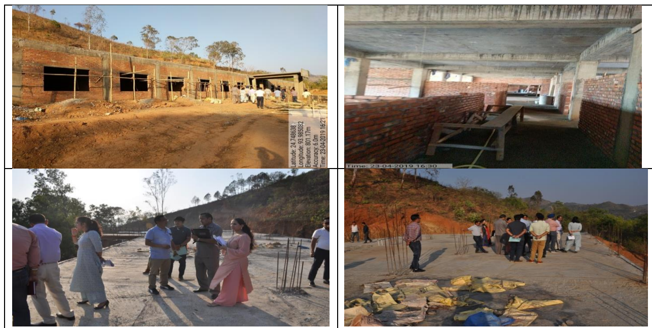
Fig:7 Construction of 50 bedded integrated AYUSH Hospital at Keiro, Imphal East