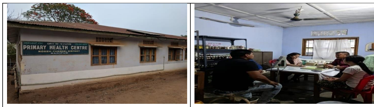
Fig:19 PHC at Moreh

All the facilities are being shared between Allopathy & AYUSH. The Average daily patient turnout for AYUSH System was 10 to 12. There were 2 Homoeopathy Doctors and both were contractual under NRHM. There was neither pharmacist nor any supporting staff available in the co-located facility. The doctors have undergone Skilled Birth Attendant and Integrated Management of Neonatal and Childhood Illnesses training programme etc. The doctors were involved in few National Health Programmes also. The doctor also informed that the patients from Myanmar also come especially for skin disease problems.