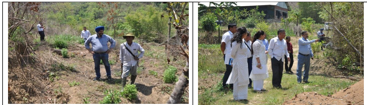
Fig:25 Medicinal Plant Cluster at Khoirom Village, Thoubal