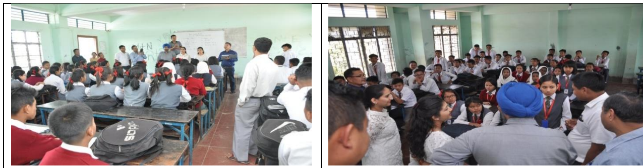
Fig:10 School Health Programme at Ananda Purna School, Thoubal district