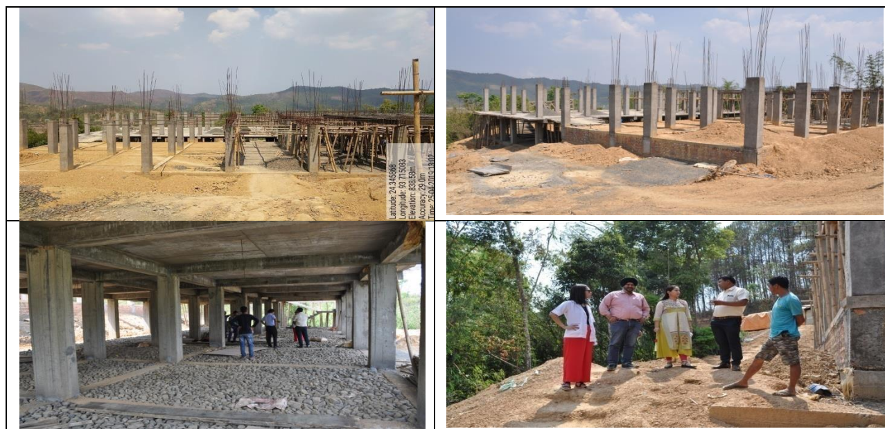
Fig:18 50 bedded integrated AYUSH Hospital at Churachandpur

Under National AYUSH Mission, an amount of Rs. 321.00 Lakhs, Rs. 200.00 Lakhs & Rs. 100.00 Lakhs as non-recurring assistance were approved in the year 2016-17, 2017-18 & 2018-19 respectively for Setting up of 50 bedded integrated AYUSH Hospital at Churachandpur.