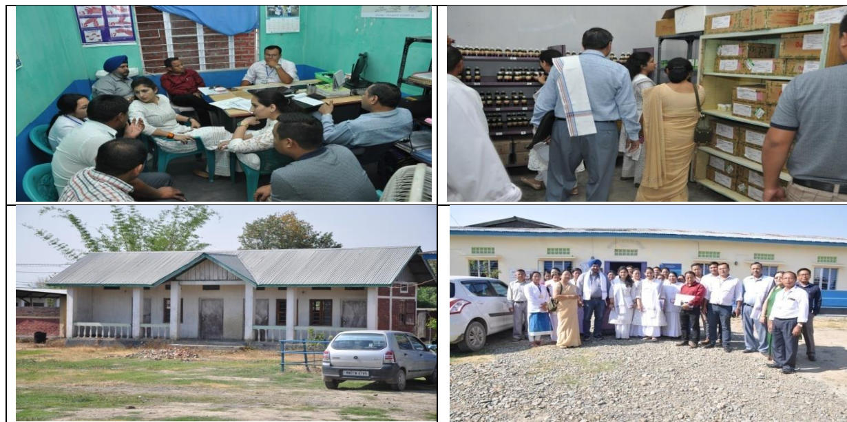
Fig12: PHC, Wangjing at Thoubal District

Salary of contractual doctors was stated to be around thirty thousand rupees and of pharmacist is nine thousand rupees; whereas the salary of regular doctors is around fifty six thousand rupees. The doctors have undergone Skilled Birth Attendant and Integrated Management of Neonatal and Childhood Illnesses training programme etc. The doctors were involved in few National Health Programmes and a members of Rogi Kalyan Society also.