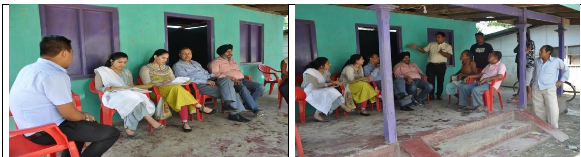
Fig 13: Public Health Outreach Activity at Nambol Naorem, Bishnupur

The team interacted with the villagers residing nearby the locality. On interaction, villagers seems to be satisfied with the 1 day health check up camp in their area and as a result public got to know the system of AYUSH and started visiting nearby PHCs/CHCs.