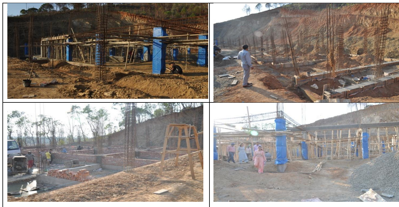
Fig:6 Construction of Homoeopathic College, Keiro under NAM

It has been observed that State has not followed MSR guidelines issued by CCH (Central Council of Homoeopathy) before finalising the DPR & construction of the building.