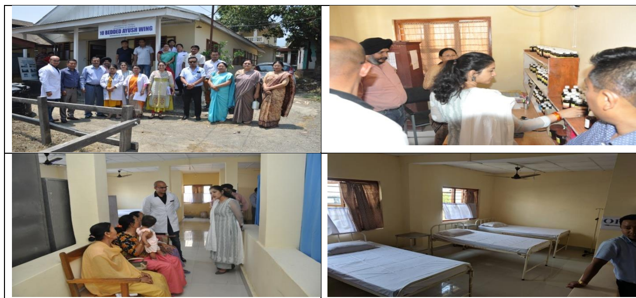
Fig:14 10 bedded AYUSH Wing, DH at Bishnupur District constructed under NAM

programme etc. The doctors were involved in few National Health Programmes also. Interactions with the patients brought positive feedback about the above said facility and the doctor.