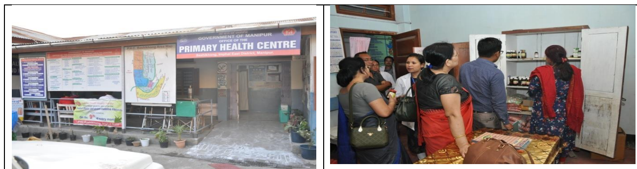
Fig:8 PHC Bashikhong, Imphal East District