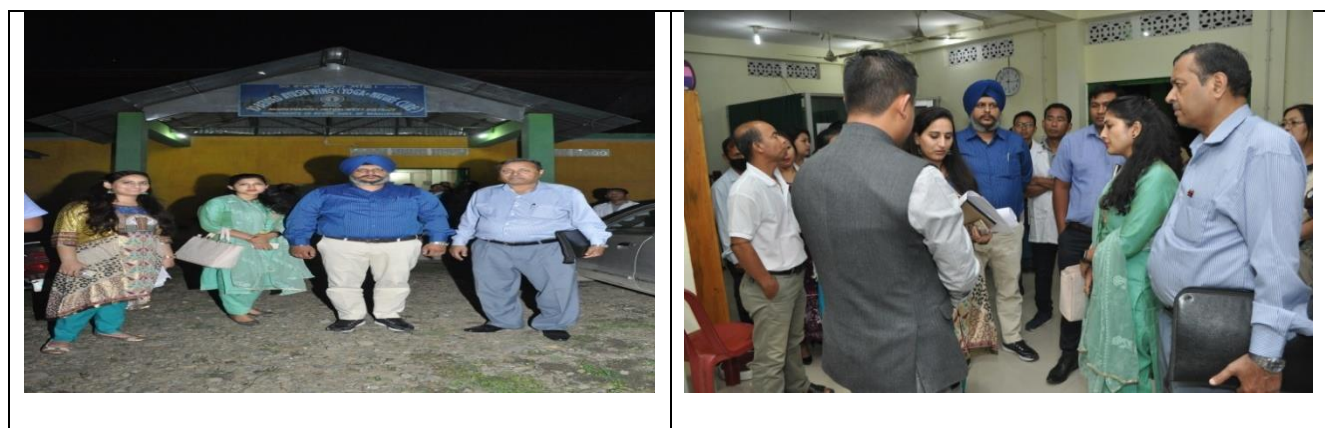
Fig:3 AYUSH Wellness Centre at Mongsangei, Imphal west

The AYUSH Wellness Centre at Mongsangei, Imphal west was in the building of 10 bedded AYUSH Wing (Yoga-Nature cure). The Wellness Centre comprises of 1 Yoga Room, separate treatment section for Naturopathy for Male/ Female, Steam bath room, doctors room and Staffs room. The Staffs of 3 AYUSH Doctors, 2 Yoga trainers, 2 Supporting Staffs, 1 ANM and 1 Ward Attendant were available in the facility. All the Staffs were regular. Under National AYUSH Mission, an amount of Rs. 6 lakhs were allotted in the year 2015-16 and 2016-17 each respectively. Out of this amount, an amount of Rs. 10.8 Lakhs were provided for salary purpose of 1 treatment assistant, 1 Ayush doctor, 1 Yoga Instructor, 1 Attendant and 1 Chowkidar. However, State has not recruited any manpower yet. The average daily turn out of patients for AYUSH System was found to be 15-20 for Yoga and 3-4 patients for Naturopathy. AYUSH Doctors available in the facility have not undergone any training programme and no doctor was involved in any National Health programme. The Staffs requested for an increase of funds under NAM because of the requirement of instruments and equipments for Naturopathy for better service delivery.